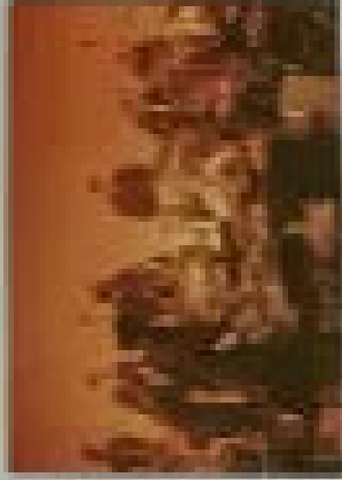
THE CHORUS OF THE UNIVERSITY OF CHICAGO, 1910