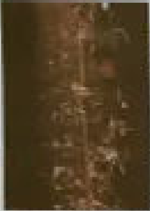
THE CHORUS OF THE UNIVERSITY OF CHICAGO, 1910