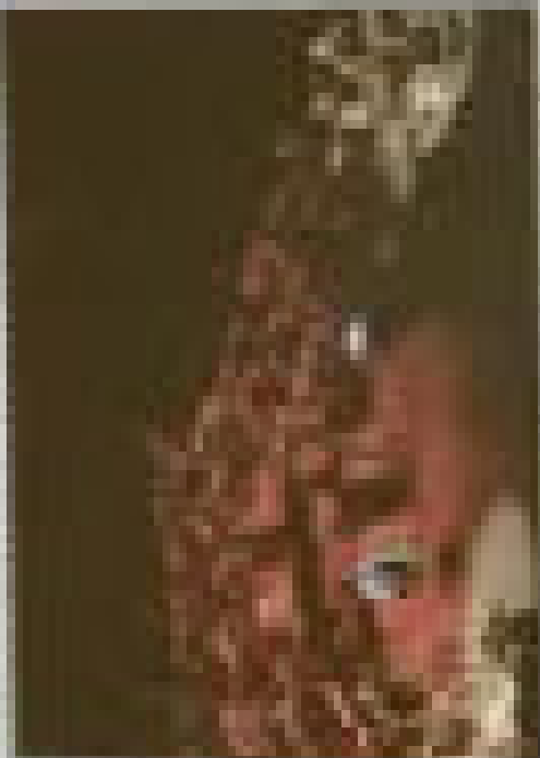
THE CHORUS OF THE UNIVERSITY OF CHICAGO, 1910